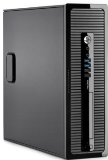
HP ProDesk 400 G1 Small Form Factor Business PC